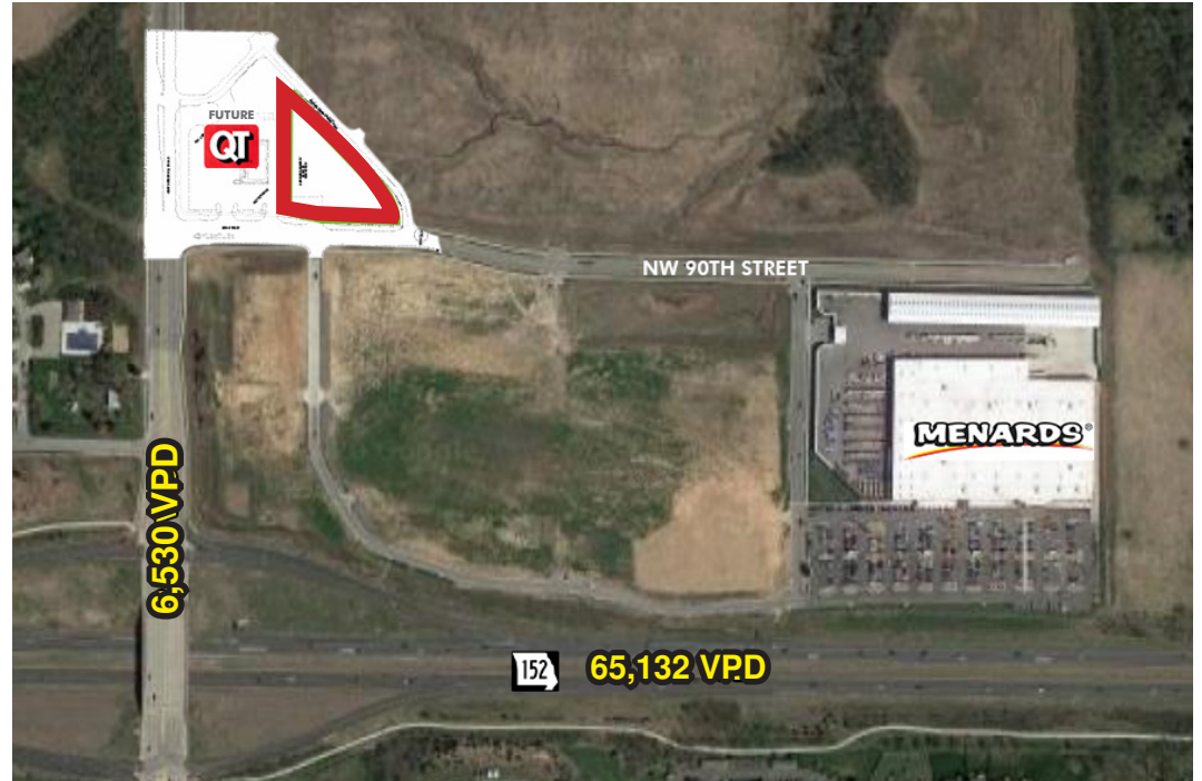
Traffic Count