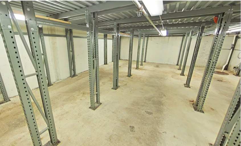
1,500± SF basement storage/warehouse area