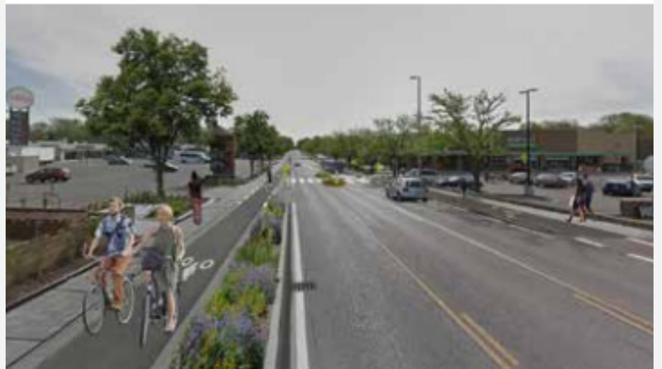
Street Improvement Plan Concept Art

The 47th Street improvement project was completed in early fall 2023! The 47th Street Improvement plan was designed to be very pedestrian friendly, with new bike lines, pedestrian refuge islands, decorative benches, new trash cans and new street lights with The 47 branding!